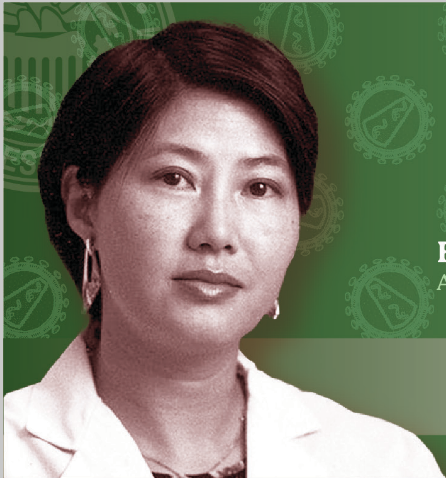
Flossie Wong-Staal American Virologist