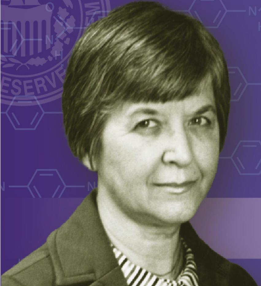
Stephaine Kwolek American Chemist